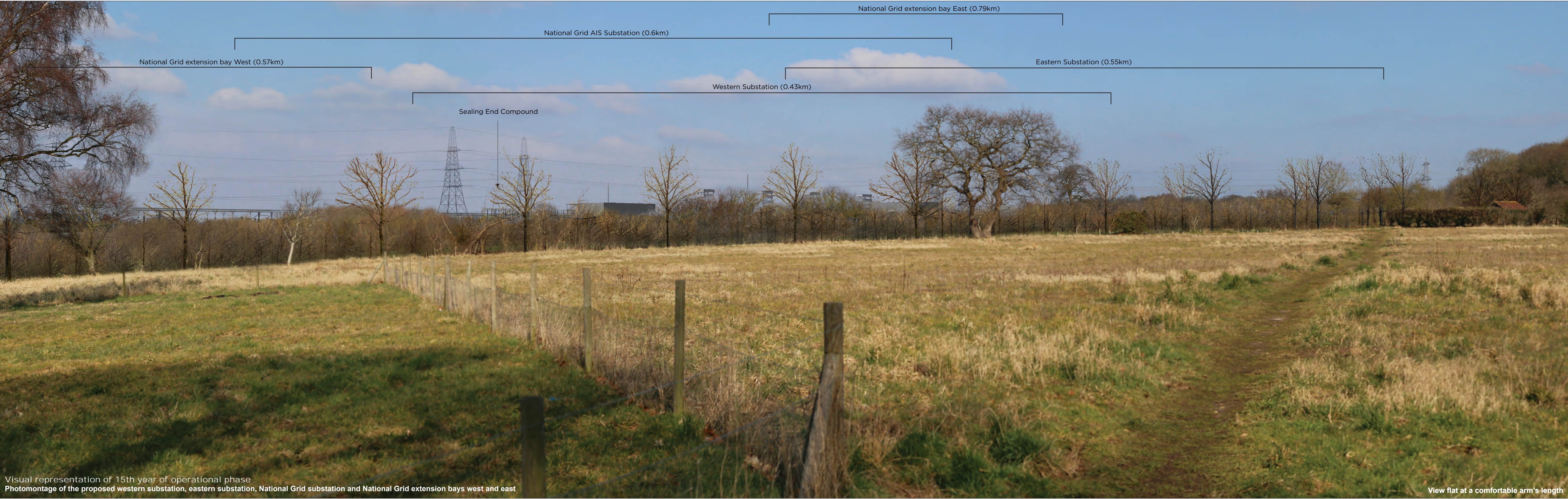
Visual representation of 15th year of operational phase Photomontage of the proposed western substation, eastern substation, National Grid substation and National Grid extension bays west and east