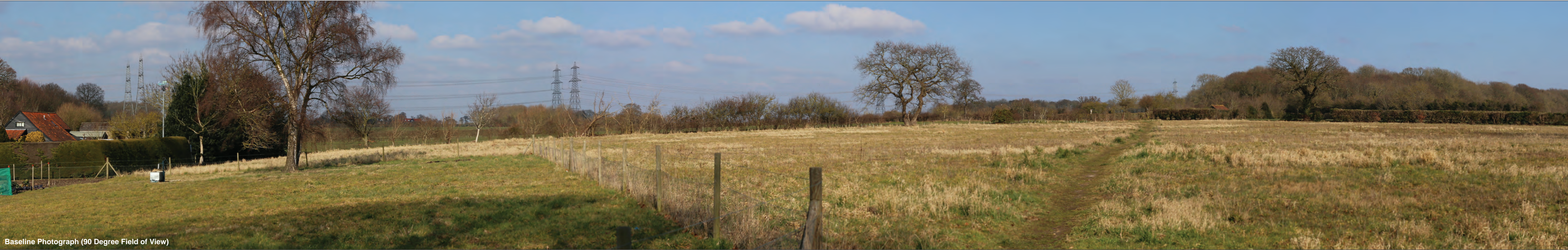
Baseline Photograph (90 Degree Field of View)