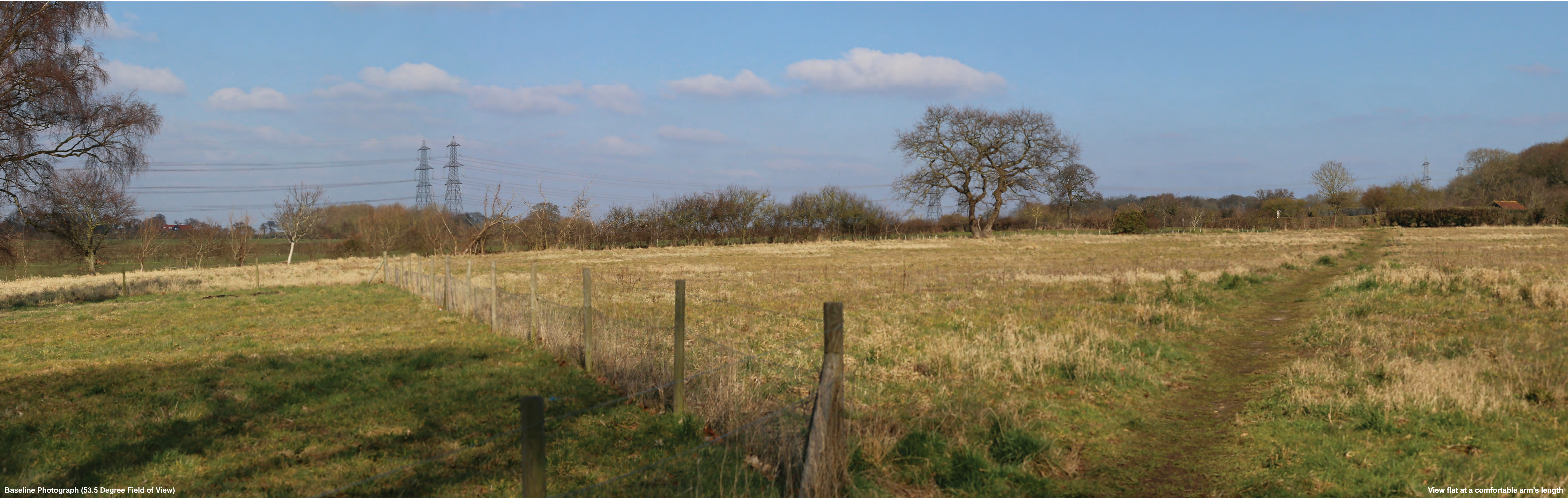
Baseline Photograph (53.5 Degree Field of View)