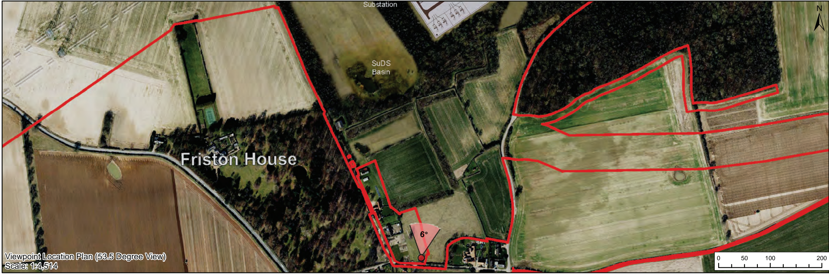
Viewpoint Location Plan (53.5 Degree View) Scale: 1:4,514