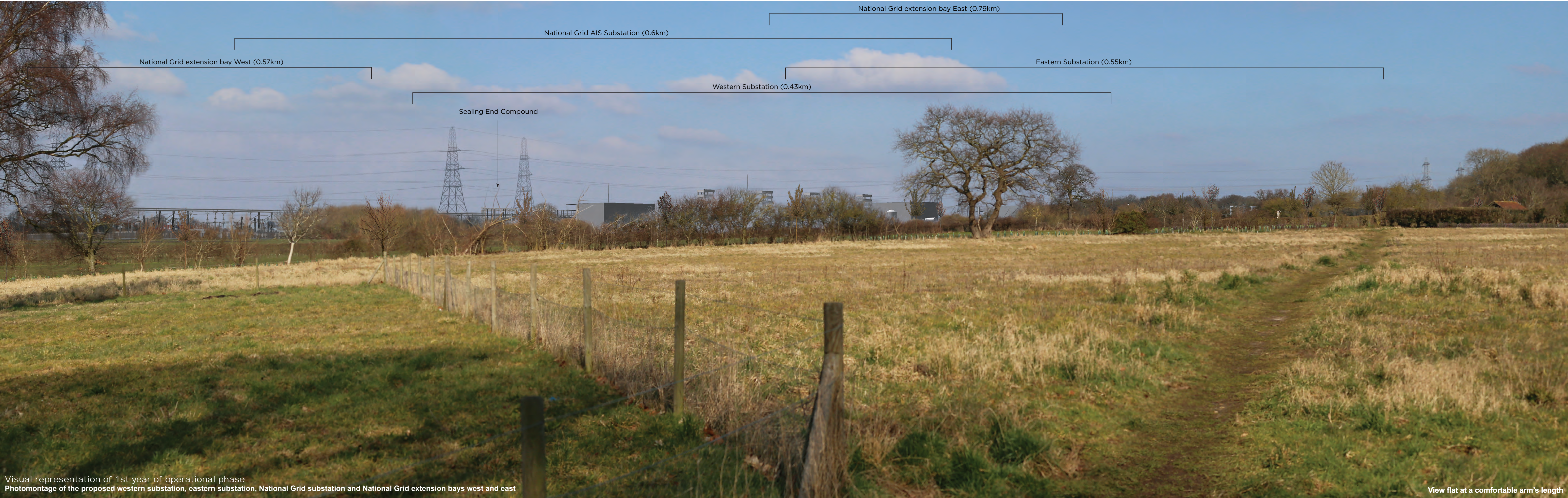
Visual representation of 1st year of operational phase Photomontage of the proposed western substation, eastern substation, National Grid substation and National Grid extension bays west and east